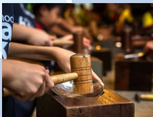
Royal Selangor Pewter