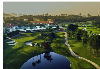
Kuala Lumpur Golf & Country Club (KLGCC)

The 13th Asia Pacific General Galvanizing Conference (APGGC) is hosting a golf tournament on 23rd June 2025 at the prestigious Kuala Lumpur Golf & Country Club (KLGCC), with a tee-off time at 7:00 AM. Golf enthusiasts will have the chance to play on an award-winning course, unrivalled in the region, and create unforgettable memories.